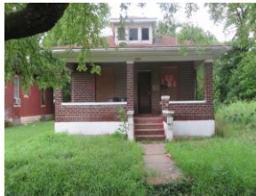
1631 North 47 th Street, WP Duplex