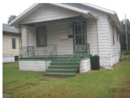
1706 North 47 th Street, WP 1-bedroom home