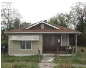
1740 Trendley Ave., ESL $17,900 $600 Down/$375 a Month