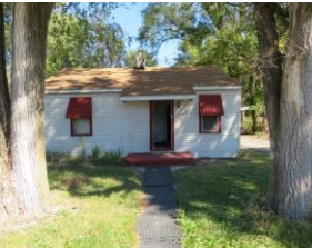
4817 McCasland Ave., ALRT $24,900 $700 Down/$425 a Month