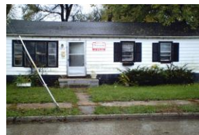
2918 Belleview Avenue, ESL 3-Bedroom home