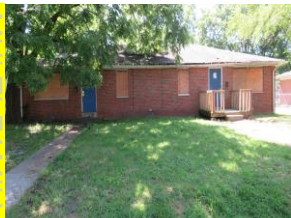
512-14 North 79 th St. ESL $50,000 $1,500 Down/$600 a Month

SEE AN ASSOCIATE FOR OUR VACANT LOTS AVAILABLE FOR TERMS OR CASH SALE