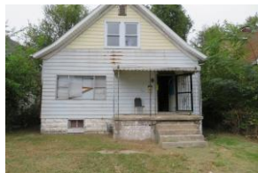
443 North 22 nd Street, ESL 2-bedroom home, basement