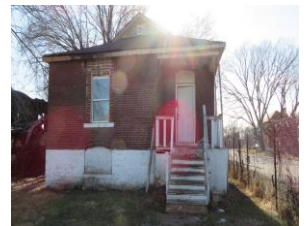
1900 College Avenue, ESL $9,900 $400 Down/$300 a Month