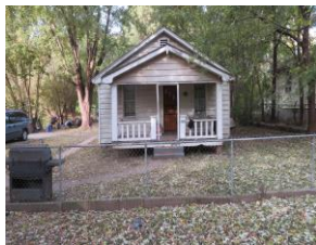
2203 North 51 st Street, WP $24,700 $700 Down/$400 a Month