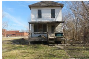
1506 North 41 st Street, ESL Large 3-bedroom home, basement