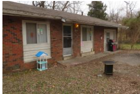
2304 North 60 th Street, WP 3-bedroom brick home