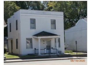
20 South 17 th St. BEL $49,900 $4,000 Down/$700 a Month (Shown by appointment only)