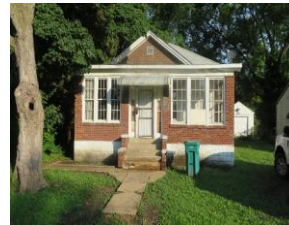
633 North 81 st Street, ESL $18,000 $600 Down/$400 a Month