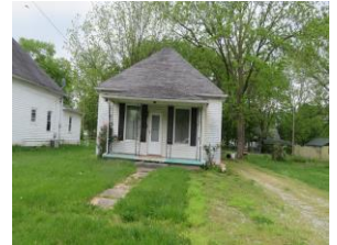
910 S. Bess Ave., Marissa $18,900 $700 Down/$425 a Month