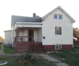
548 North 22 nd St., ESL $34,900 $900 Down/$500 a Month