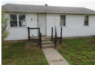
509 South 5 th St. LVJ $29,900 $900 Down/$500 a Month