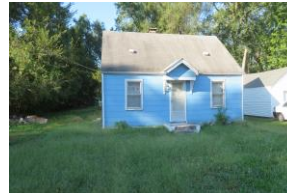
2432 Lorraine Drive, Cahokia 2-bedroom home on large lot