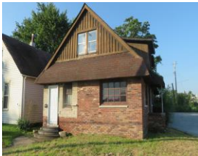
3434 State St., ESL $25,000 $700 Down/$450 a Month