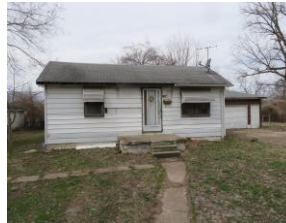
725 North 79 th St. ESL $19,900 $600 Down/$400 a Month